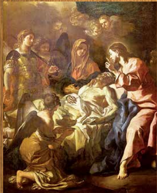
DEATH OF ST. JOSEPH