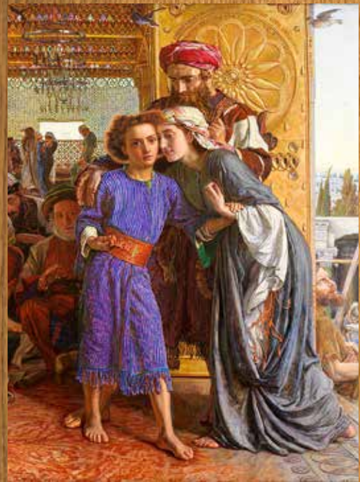
FINDING OF JESUS IN THE TEMPLE