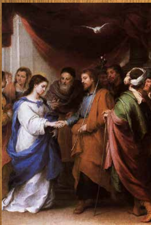
THE BETROTHAL OF THE VIRGIN MARY TO JOSEPH