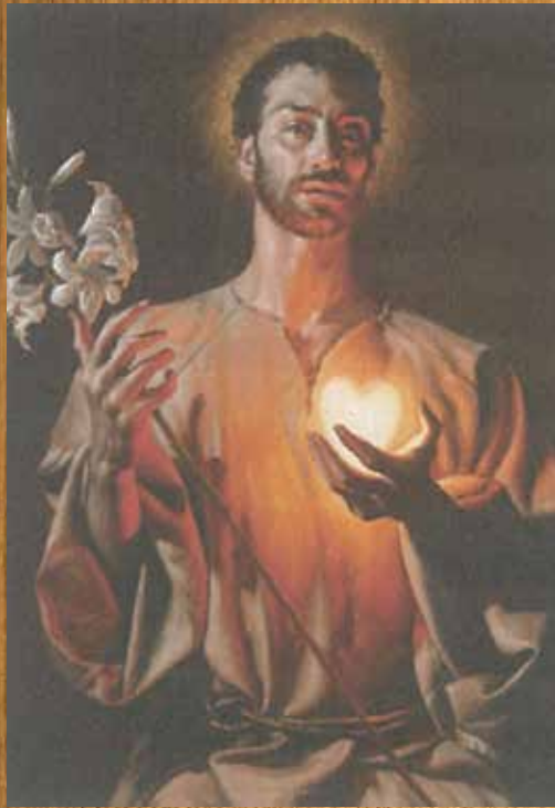
THE EXALTATION OF MARY AND JOSEPH