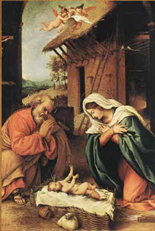
THE BIRTH OF JESUS