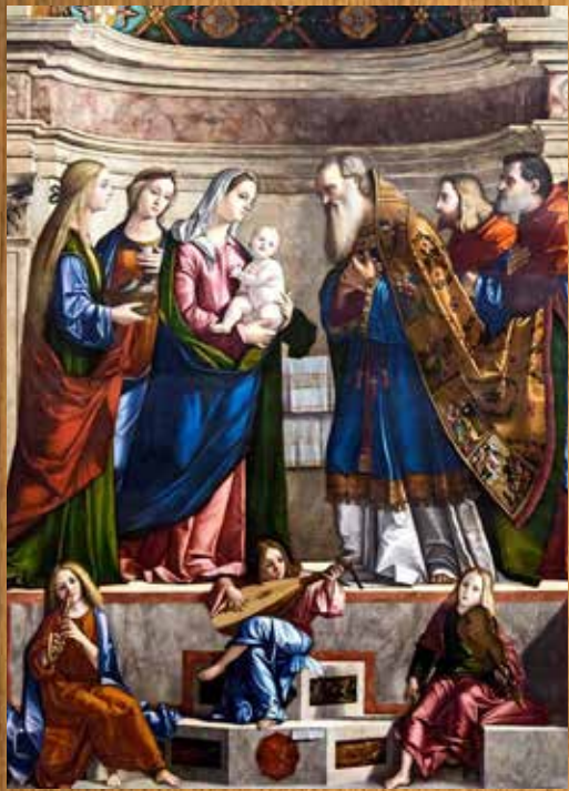
THE PRESENTATION OF JESUS