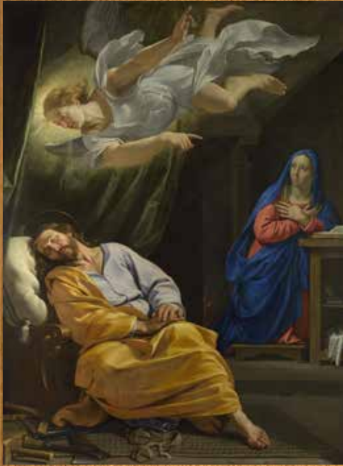
THE ANUNCIATION OF THE BIRTH OF JESUS TO MARY AND JOSEPH