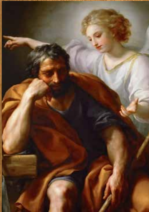
THE EXILE OF THE HOLY FAMILY TO EGYPT